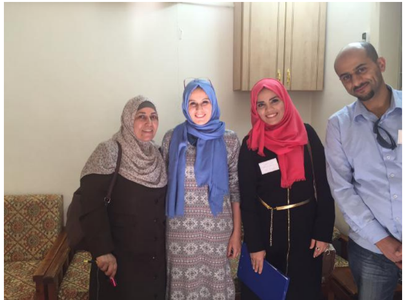
Fellows from ICfC's Disaster Preparedness workshop in the classroom, out in the field, and conducting intensive interviews at the homes of Jericho residents at risk for earthquakes, flashfloods, and mud- and boulder-slides from surrounding mountains. (May 2016)